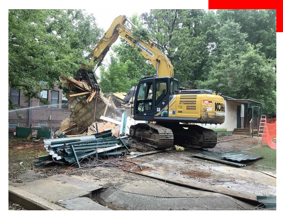
Portable trailer demolition